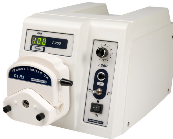
i250 with C1 R3 Single Channel Pump Head

The iPump i250 is a high performance peristaltic pump, it has been designed and manufactured to a high standard giving long and reliable operation. Its wide range of flow from 0.07 to 2200 ml/min makes it suitable for both laboratory and industrial applications. It has the ability to adjust the speed either manually or automatically using the external control interface, the pump can use either our C1 R3 rapid loading pump head which allows tubing change in just a few seconds or our B type 2 or 4 channel pump heads.